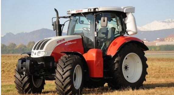
Italy / Fiat – CNG Farm Tractor