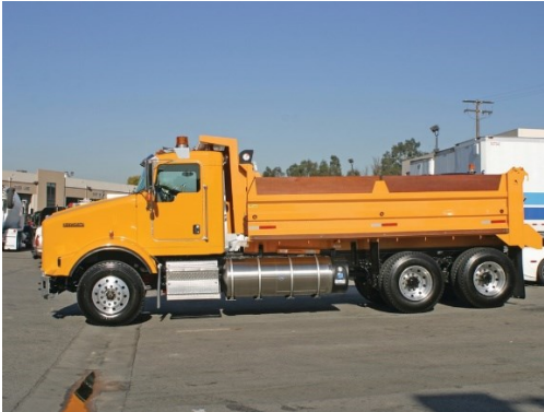
USA LNG Dump Truck