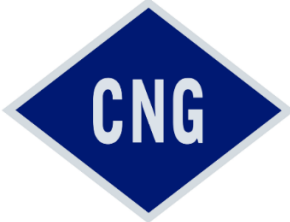
CNG – Fuel Tank behind Tractor Cab