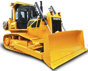
China LNG Bull Dozer