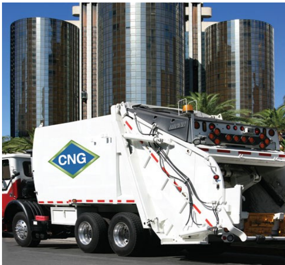
CNG City Trash Trucks