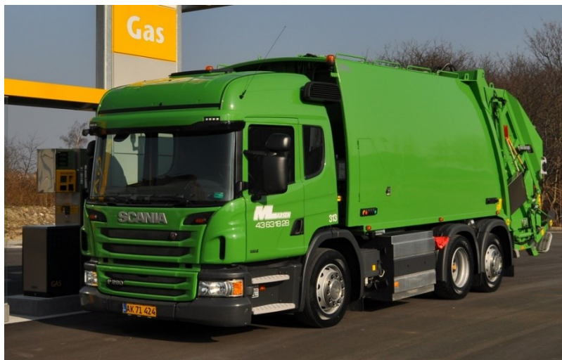
British – Scania CNG Trash Truck