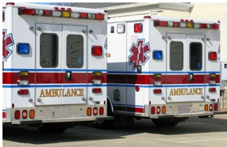
City / County Emergency Vehicle CNG Fleets