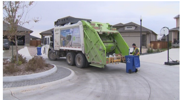
CNG City Trash Trucks