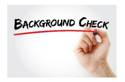
Employee Background Checks

Human Resource Professionals with experience working with the Federal Bureau of Investigation (FBI), the Central Intelligence Agency (CIA), and the National Security Agency (NSA), are essential to become a member of the Human Resources Team at Pendulum Employee Staffing Company, to nurture a Corporate Culture by Recruiting / Hiring Employees using extensive Pre-Employment Background Checks that meet the Qualities that we will set as a Standard for the Personnel of Pendulum Employee Staffing Company and for the Personnel of each Subsidiary Company of our three (3) Corporate Trust.